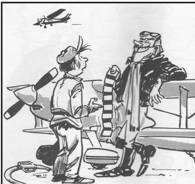
SUPERCHARGER - Hot pilot with 8 credit cards!